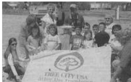
Bottom picture taken by La Junta Tribune Democrat.